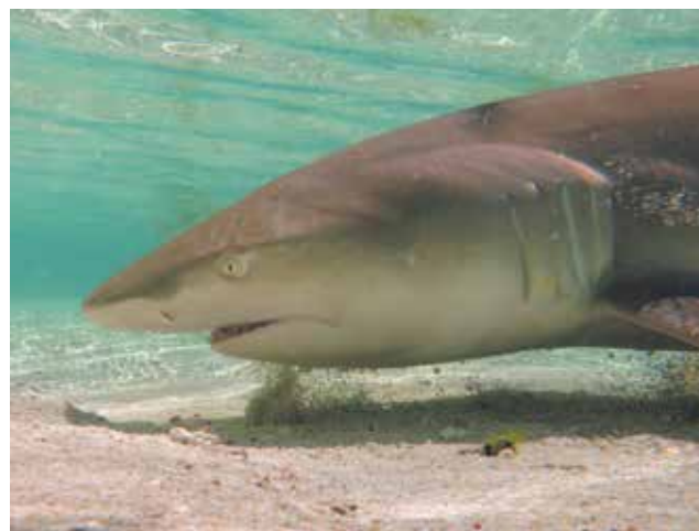
Figure 1. The lemon shark ( Negaprion brevirostris ) in a nursery site on Rocas Atoll.

In the Atlantic Ocean, four tropical oceanic islands belong to Brazil (Fig. 2). Their distance from the continental landmass makes them less affected by human impacts, such as pollution and overfishing, but it also makes them less known by the human population. Each of these islands has different characteristics, and, in 2013, the Long-Term Ecological Research of Brazilian Oceanic Islands 1 (PELD-ILOC) was set up to study these tropical 'laboratories'. Through long-term monitoring of fish, benthic organisms and coral (see Fig. 3), PELD-ILOC plays a fundamental role in understanding the processes